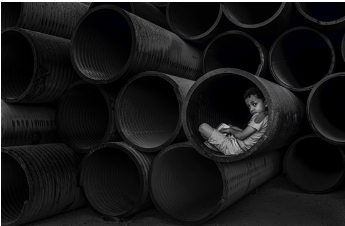
Reader 118 x 79 cm | 2014 | Photo Courtesy of The Artist