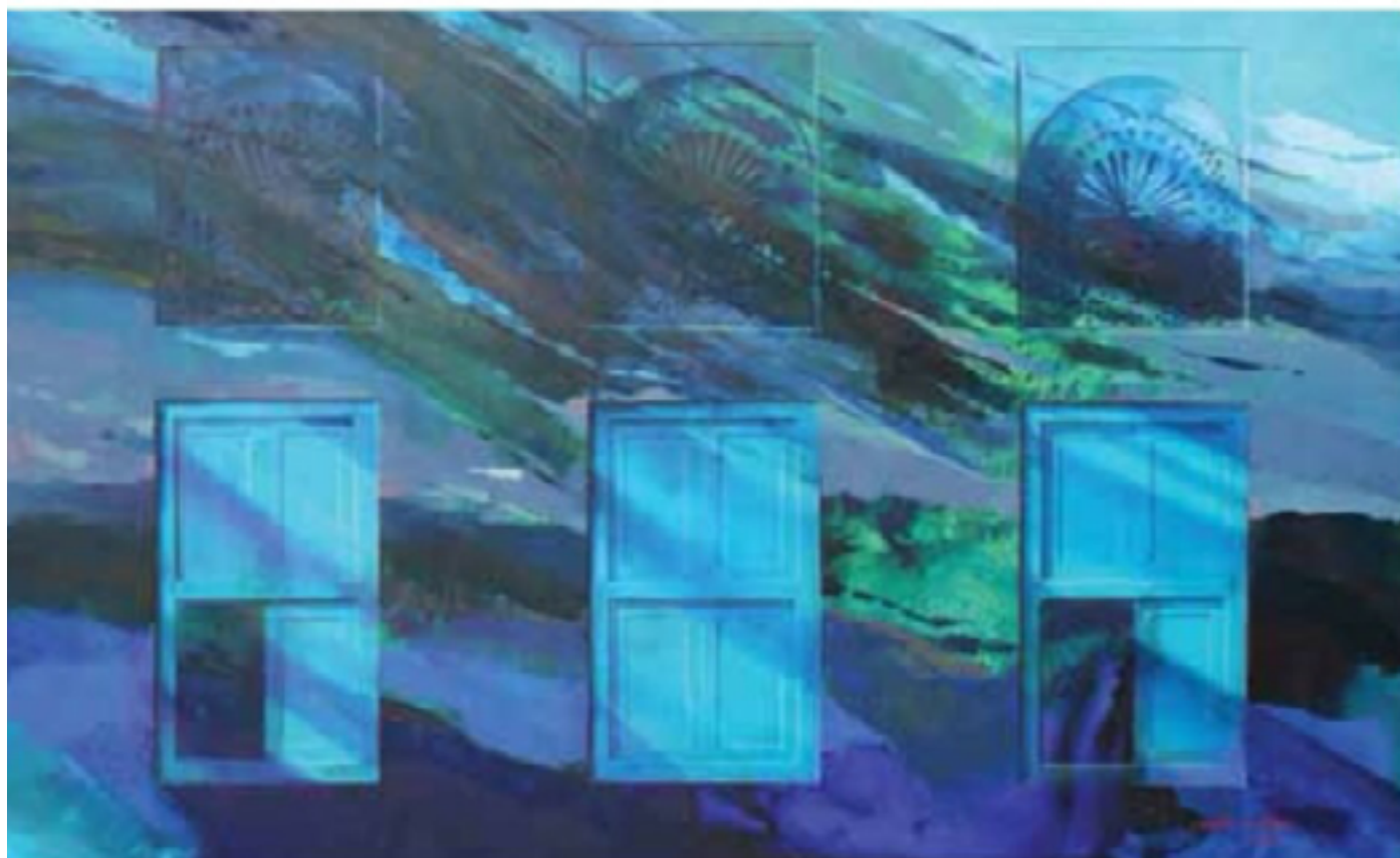
Window 120 x 180 cm | Photo Courtesy of the Artist