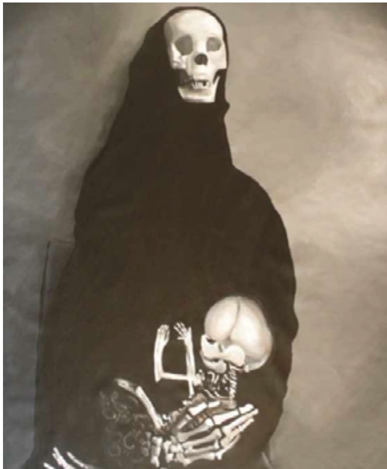
Mommy and I

Al Saleh's work has been exhibited in UAE at various exhibitions, including Art Dubai; Emirati Expression at Emirates Palace, Abu Dhabi; Macedonian Museum, Greece; Palazzo TE Museum, Italy; Centro Cultural CajaGRANADA Memoria de, Spain; and her work has also been included in many shows in the United States. Her work is also included in the Barjeel Art Foundation collection in Sharjah.