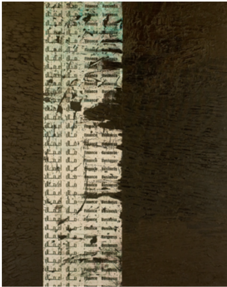
Untitled 100 x 120 cm