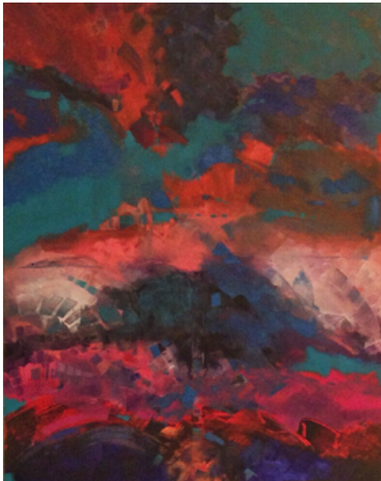
Untitled 150 x 200 cm