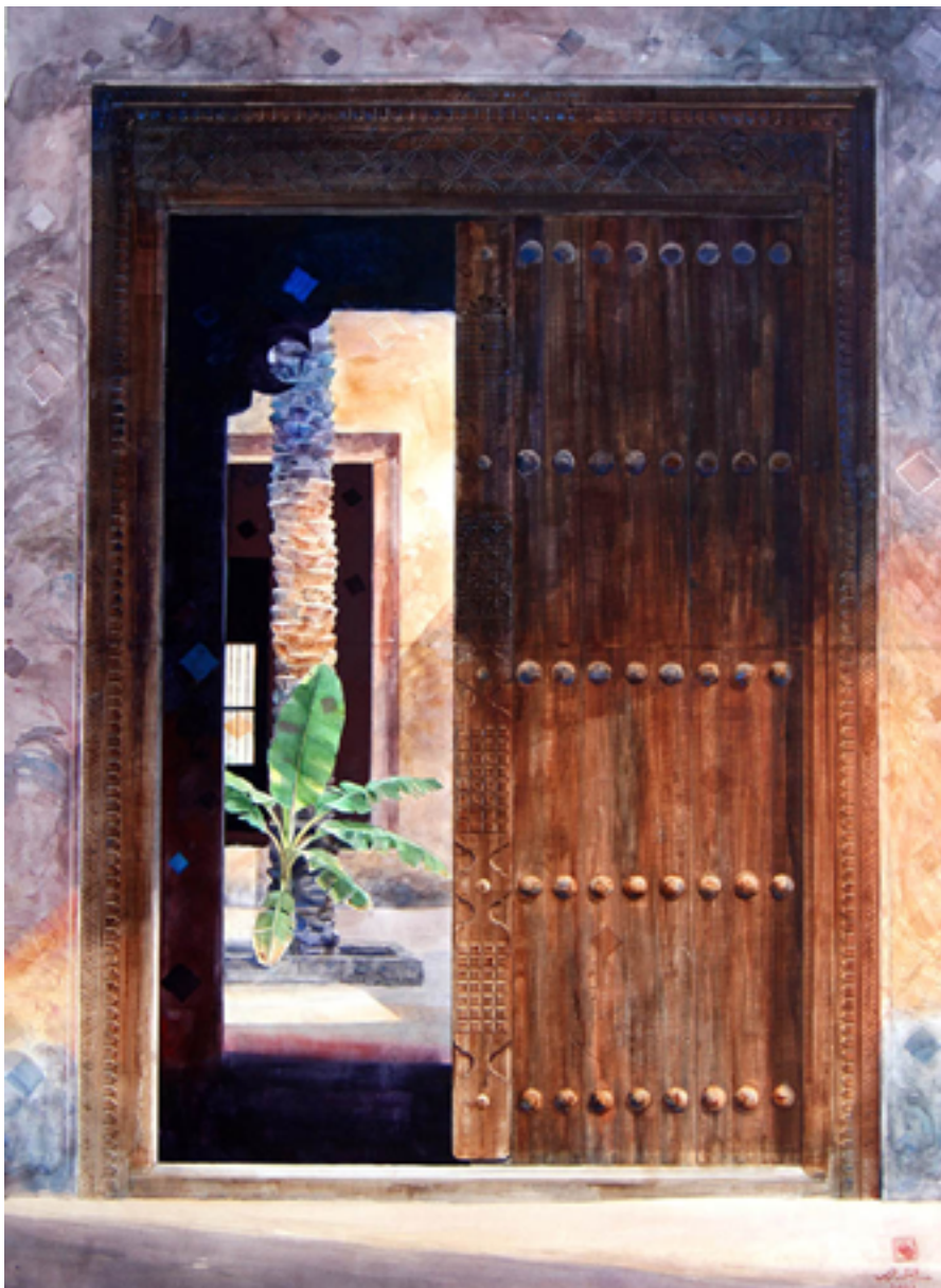
The Door 205 x 155 cm | Oil on Canvas