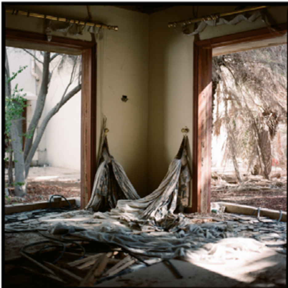
Drapes 60 x 60 cm | 2014 | Photo Courtesy of The Third Line Gallery