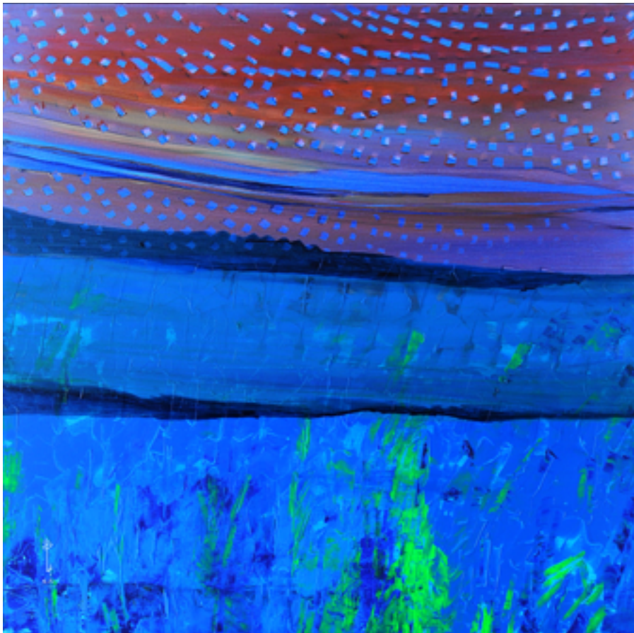
Untitled 100 x 100 cm | Photo Courtesy of the artist