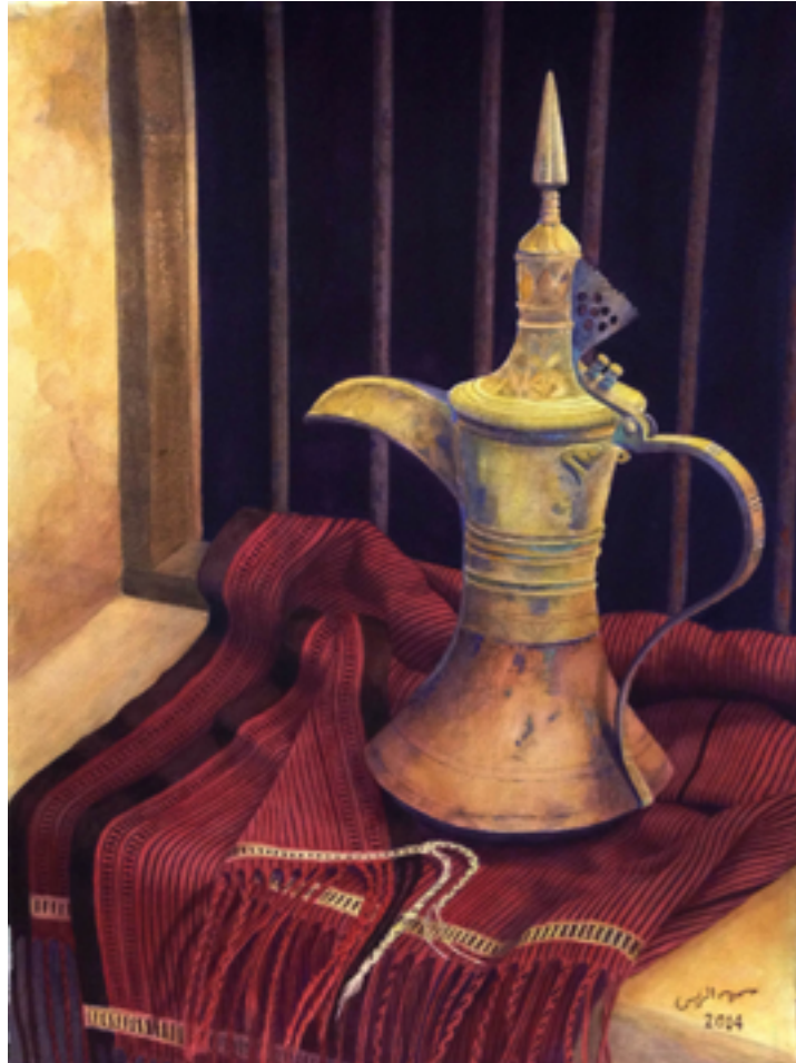
Untitled 120 x 90 cm | 2014