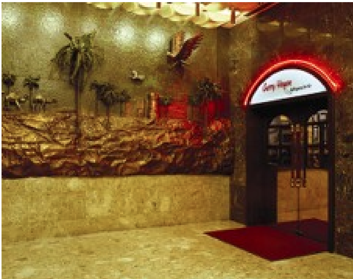
Untitled (From The Pulse Series) 60 x 60 cm | 2006