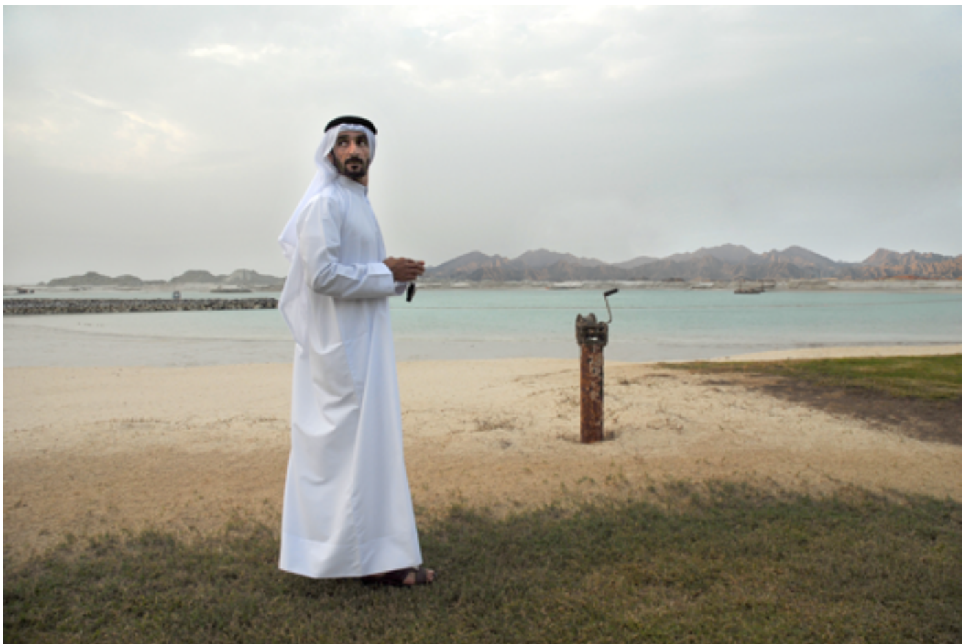
Observers of Change 2 128 x 184 cm | 2011