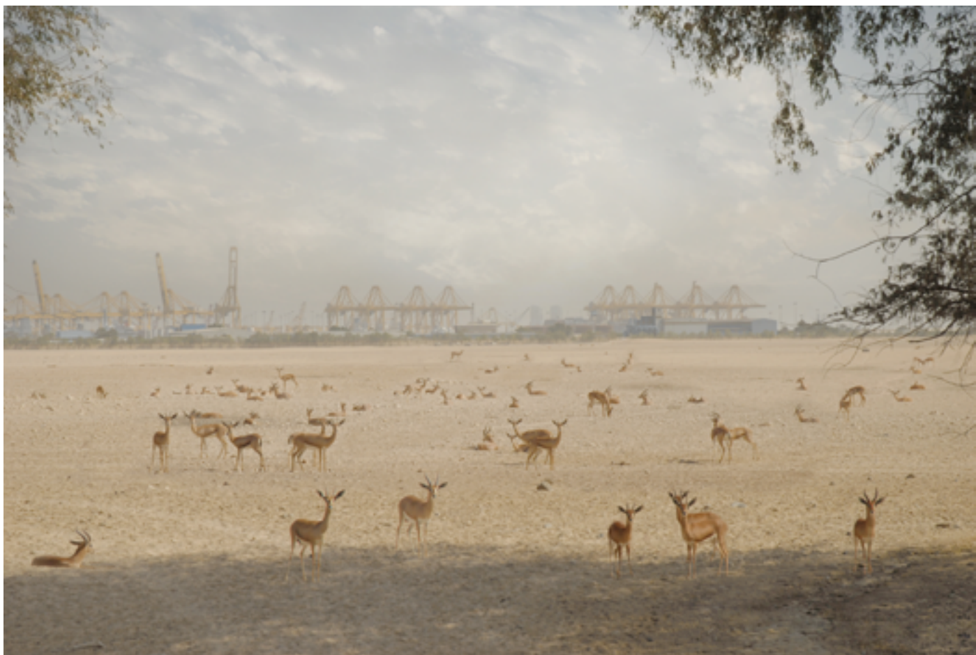
Observers of Change 3 128 x 184 cm | 2011 | Photo Courtesy of Tashkeel