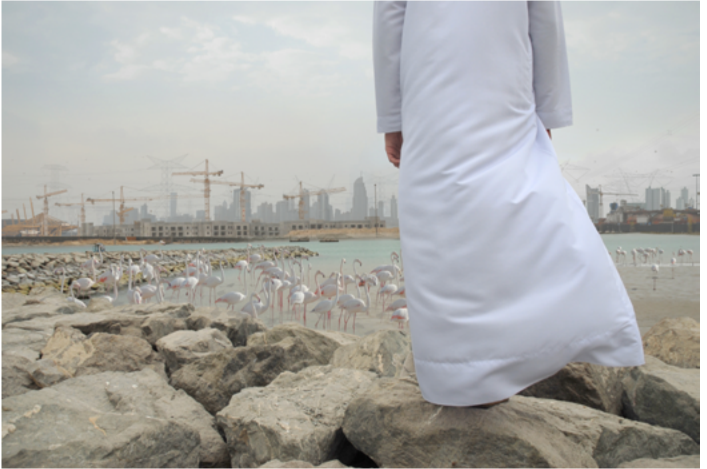
Observers of Change 4 128 x 184 cm | 2011 | Photo Courtesy of Tashkeel