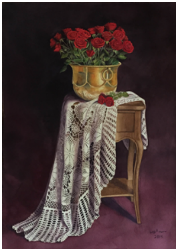
Untitled 100 x 150 cm | 2015 | Photo Courtesy of the Artist