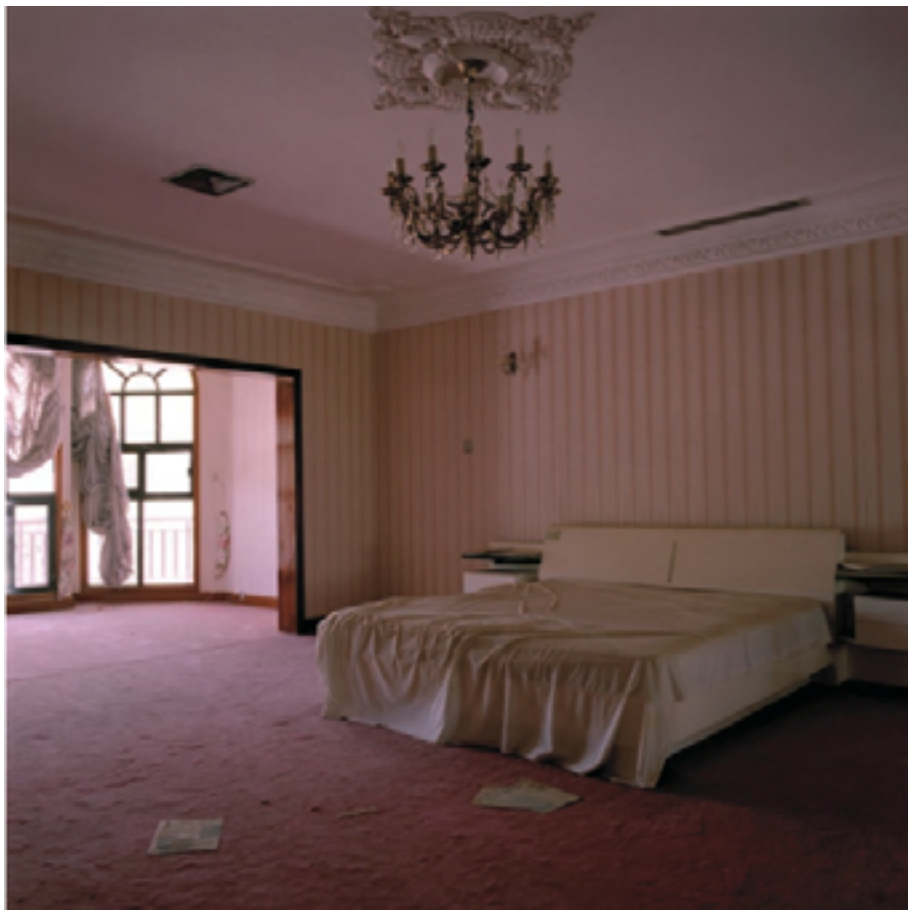
Pink Bedroom 60 x 60 cm | 2006