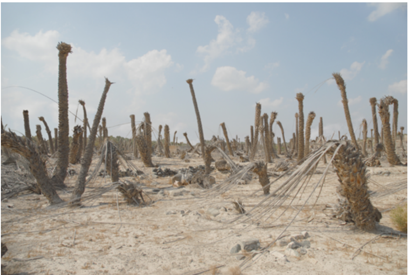
Observers of Change 1

In her series Observers of Change , part of the UAE's exhibit at the 2011 Venice Biennale, Maktoum captures the Gulf nation's transformed landscapes amid mass urbanisation, land reclamation and construction. Upturned and wilted palm trees represent an acute awareness of the conflicting environment of her homeland and the death and rebirth of cities.