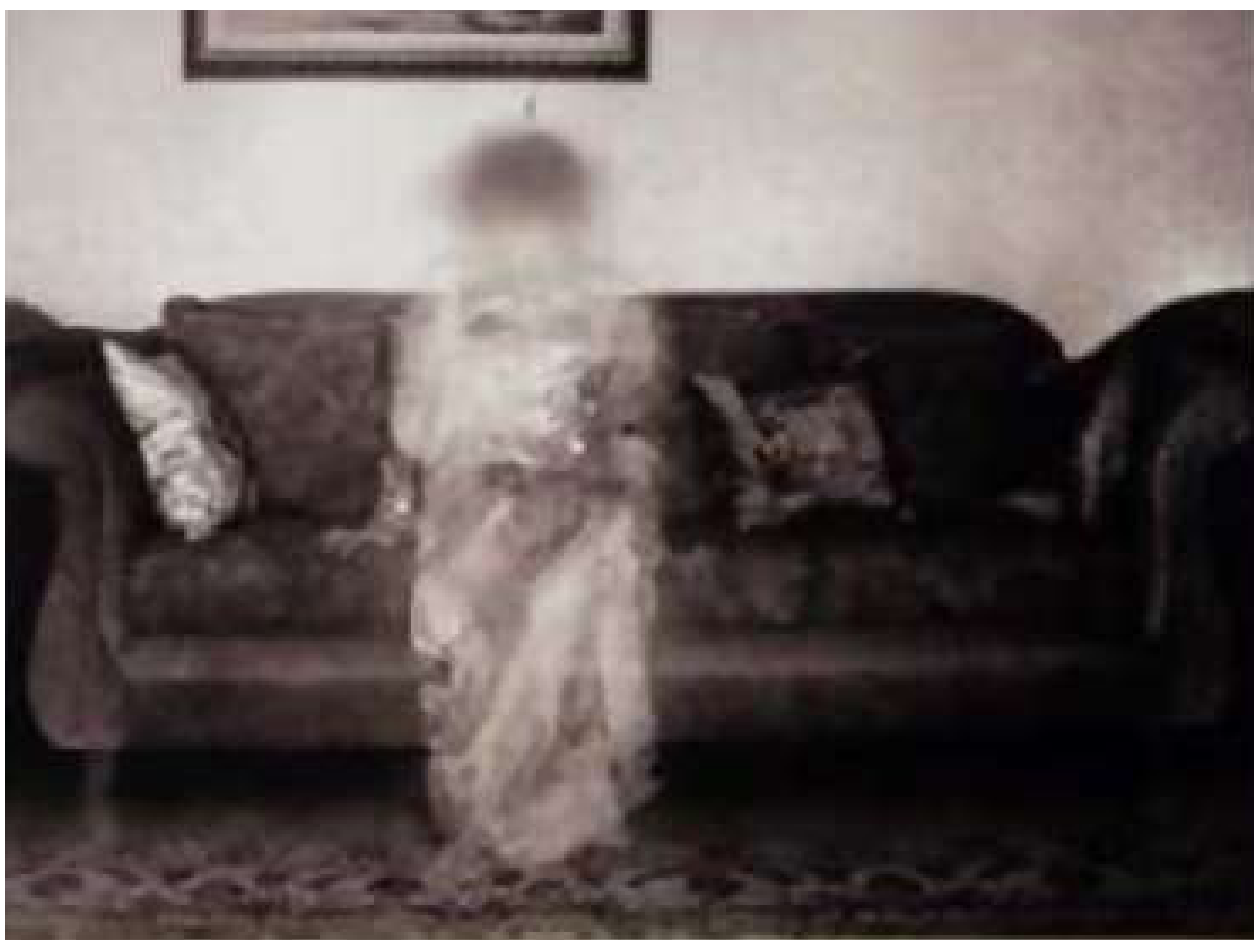
Behind Closed Doors 180 x 200 cm | 2008

She has participated in several group and solo shows both, in the UAE and abroad. Huraiz also won the Emirates Photography Award in 2007.