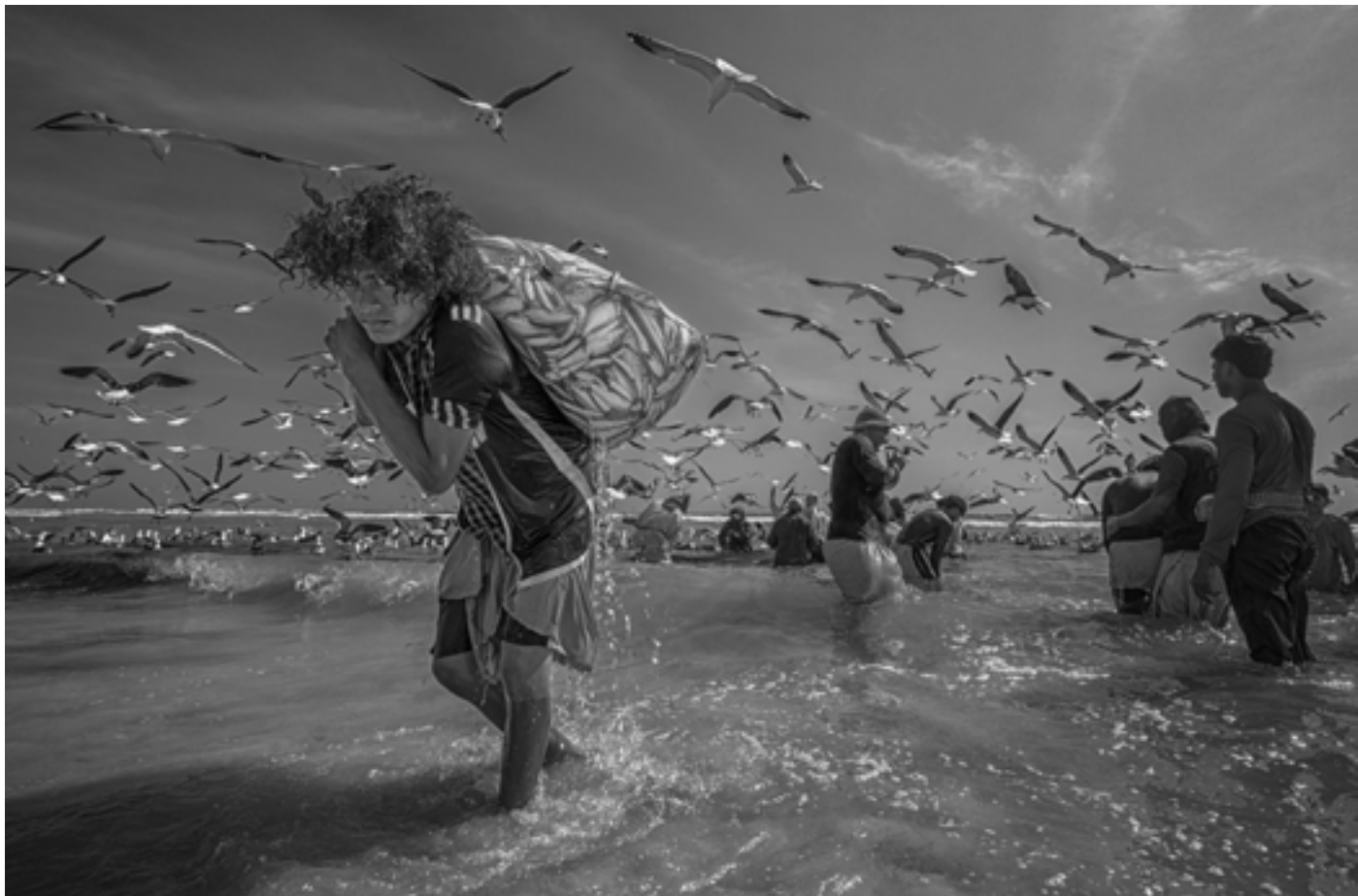
Working Time 1 118 x 79 cm | 2014 | Photo Courtesy of The Artist